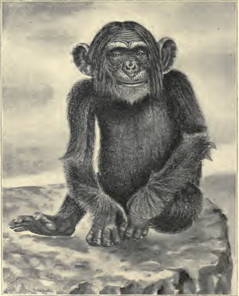
FIG. XCII. SIMIA P. CHIMPANSE. CHIMPANZEE.

Engeco Haeckel, Gen. Morph. Organism., II, 1866, pp. cl, footnote. CLX.